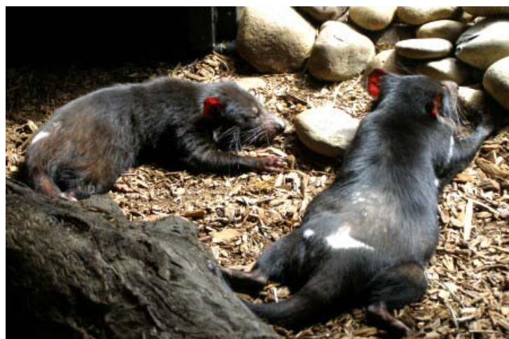
Two endangered Tasmanian Devils were oblivious to our visit. The Park is helping to breed cancer-resistant devils

We hope we will have more members come along on our next outing, and bring family & friends.