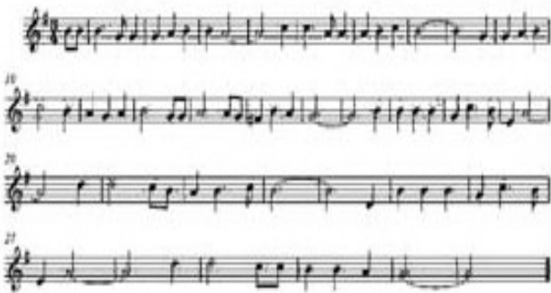
The White Rose

I love the white rose in its splendour, I love the white rose in its bloom, I love the white rose, so fair as it grows, It's the rose that reminds me of you!