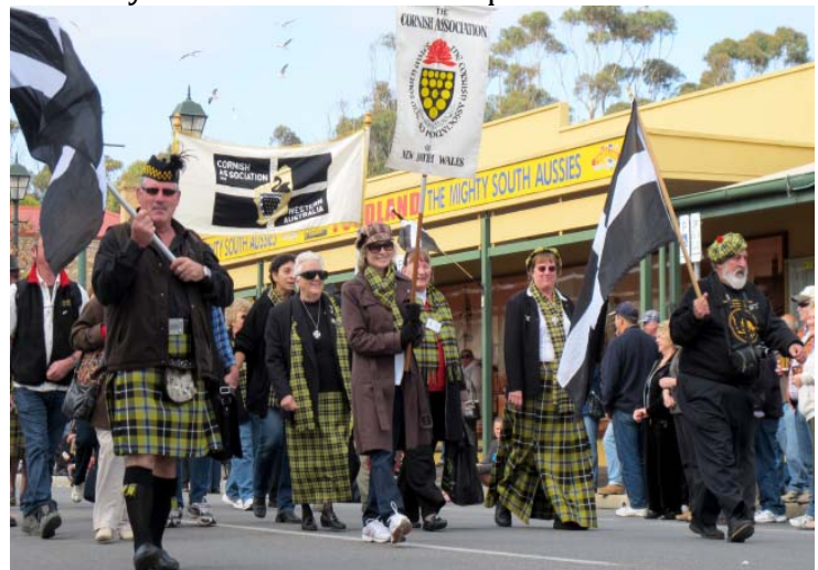
CANSW marching (tartan/banner/flags) through Moonta