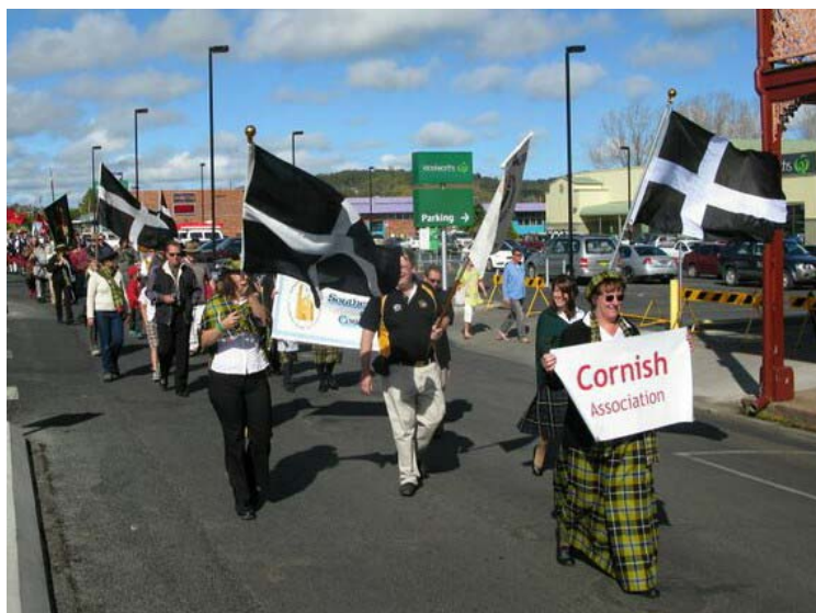
CANSW, SSOC, and other Cornish, and Bretons marching in the Parade through Glen Innes

Saturday morning's big street parade had a good contingent wearing Cornish tartans and colours, with banners and flags held high, representing CANSW, the Southern Sons of Cornwall (SSOC), South Australia and Queensland. As well, locals with Cornish ancestry or birth joined in, and also our Breton cousins.