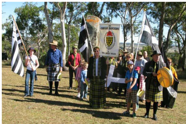
Gathering for the start of the march, at the Cornish Stone, before the Ceremony

The ring array of granite standing stones, carted from the nearby Red Range, stands 3 metres tall looking over the town from a hill nearby. The Gorsedd stone is for the Brythonic speaking Celts – Cornish, Bretons, Welsh.